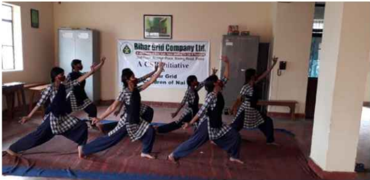
Underprivileged girls being trained in extracurricular activities in girls' free residential school Sister Nivedita Valika Vidyalaya run by NGOM/s Nai Dharti