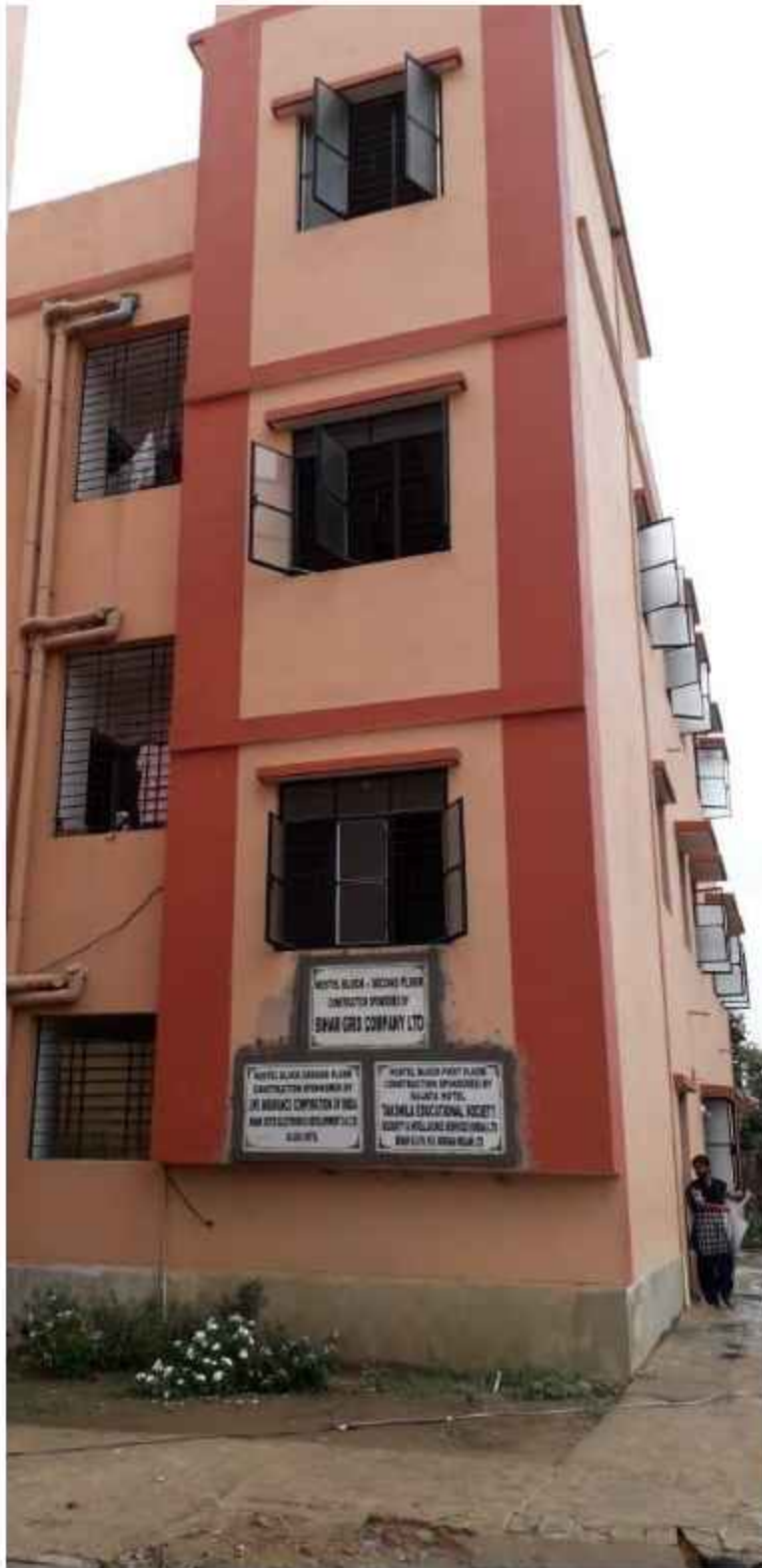
Construction of the second floor of Hostel building of girls' free residential school Sister Nivedita Valika Vidyalaya run by NGO M/s Nai Dharti completed by Bihar Grid Company Limited under past CSR activities of the Company