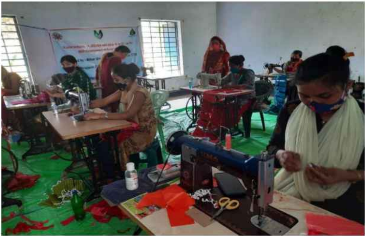
Training being imparted to the women being trained by NGO M/s KASHISH under the mentorship of M/s JEEVIKA/BRLPS, Govt. of Bihar Undertaking, sponsored by M/s Bihar Grid Company Limited under CSR activities in the state of Bihar