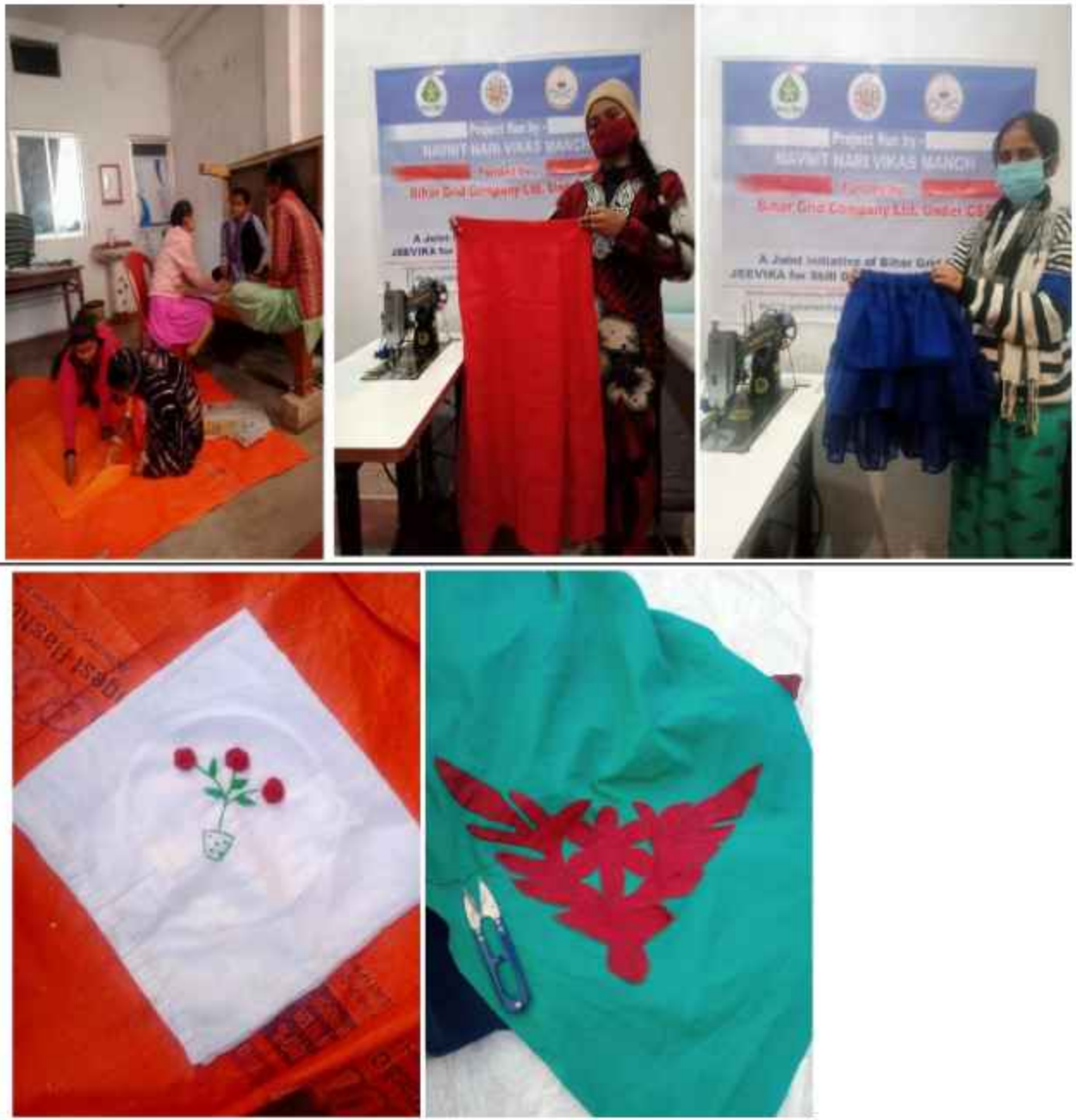
Women skill development program of M/s Navnit Nari Vikas Manch in Khagaria, Bihar, Under BGCL CSR activities for FY 2022-23