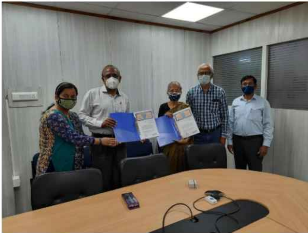
Signing of Memorandum of Understanding (MoU) between NGO M/s Nai Dharti and M/s Bihar Grid Company Limited for contributing towards the educational expenses of 60 no. girls of under privileged girls' free residential school Sister Nivedita Valika Vidyalaya, run by NGO M/s Nai Dharti in the district of Patna in the state of Bihar for the Financial Year 2021-22.