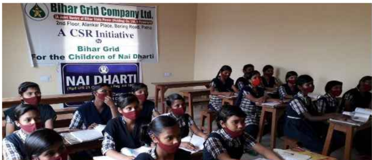
Glimpse of education provided in school to the under privileged girls' free residential school Sister Nivedita Valika Vidyalaya run by NGOM/sNaiDharti