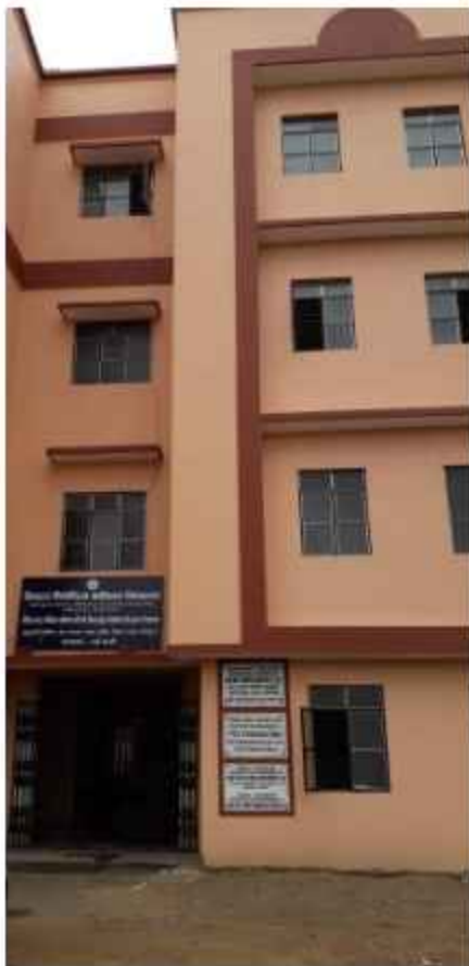
Completion of construction of third floor of School building of girls' free residential school Sister Nivedita Valika Vidyalaya run by NGO M/s Nai Dharti funded by Bihar Grid Company Limited under CSR activities of the Company