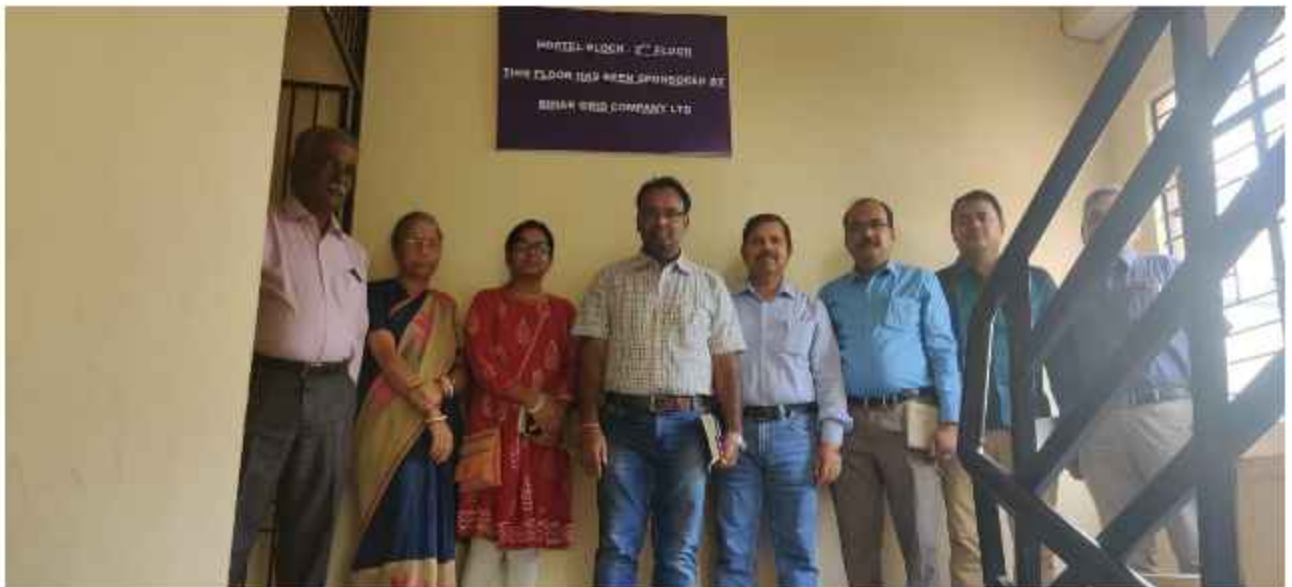
Visit of Officers of Bihar Grid Company Limited during the construction of these second floor of Hostel building of girls' free residential school Sister Nivedita Valika Vidyalaya run by NGOM/sNaiDharti