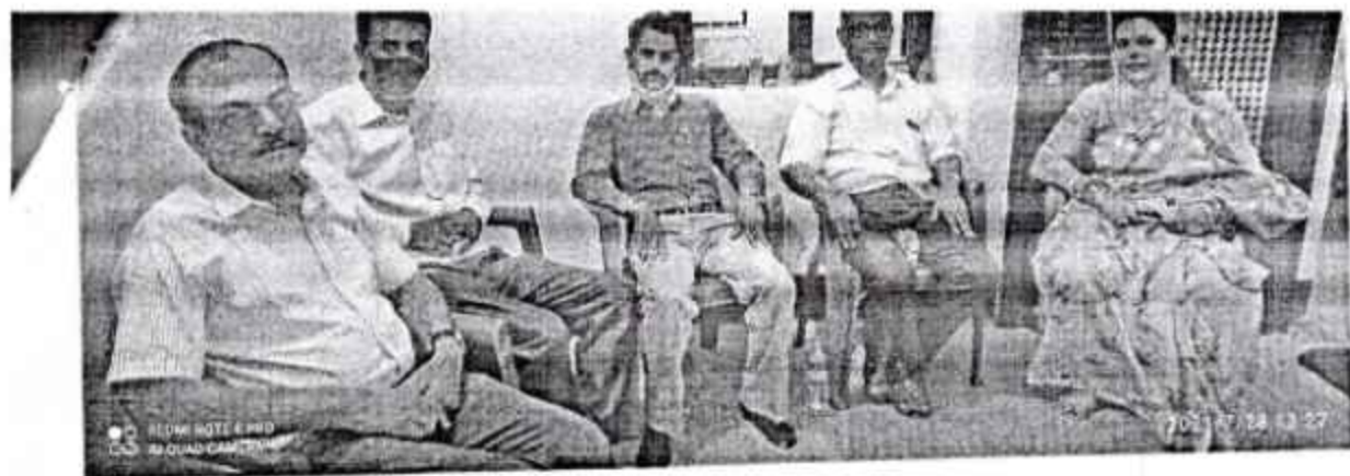
Distribute Mask & Sanitizer by the BGCL Officers