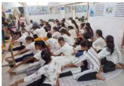
CSR activities of M/s Ekta Shiksha Sansthan at Darbhanga, Bihar