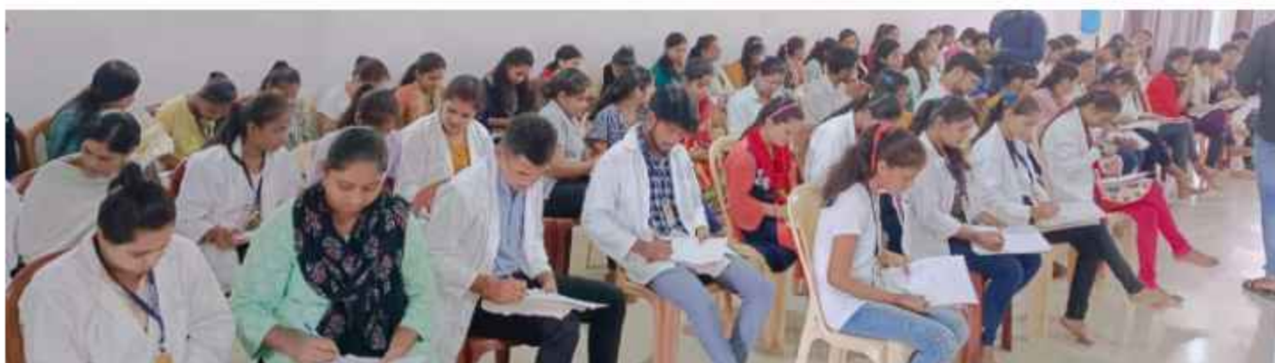
CSR activities of M/s ARADHYA at Muzaffarpur, Bihar