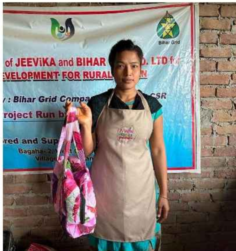
CSR activities of M/s KASHISH in West Champaran district of Bihar