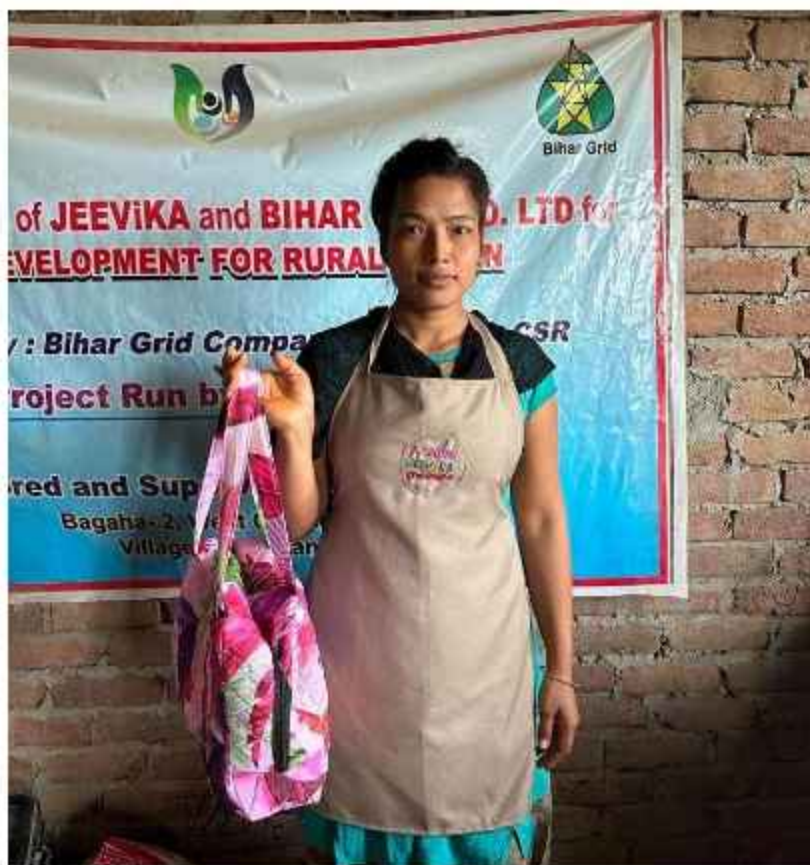
CSR activities of M/s KASHISH in West Champaran district of Bihar