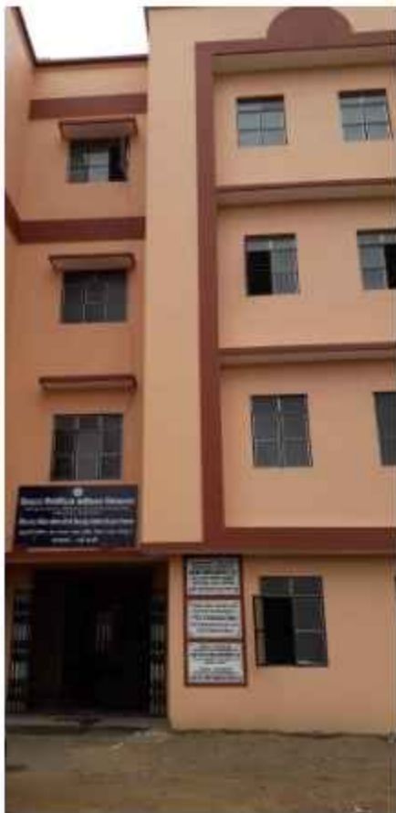
Completion of construction of third floor of School building of girls' free residential school Sister Nivedita Valika Vidyalaya run by NGO M/s Nai Dharti funded by Bihar Grid Company Limited under CSR activities of the Company