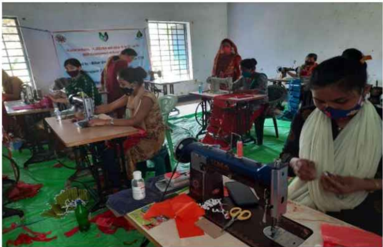
Training being imparted to the women being trained by NGO M/s KASHISH under the mentorship of M/s JEEVIKA/BRLPS, Govt. of Bihar Undertaking, sponsored by M/s Bihar Grid Company Limited under CSR activities in the state of Bihar