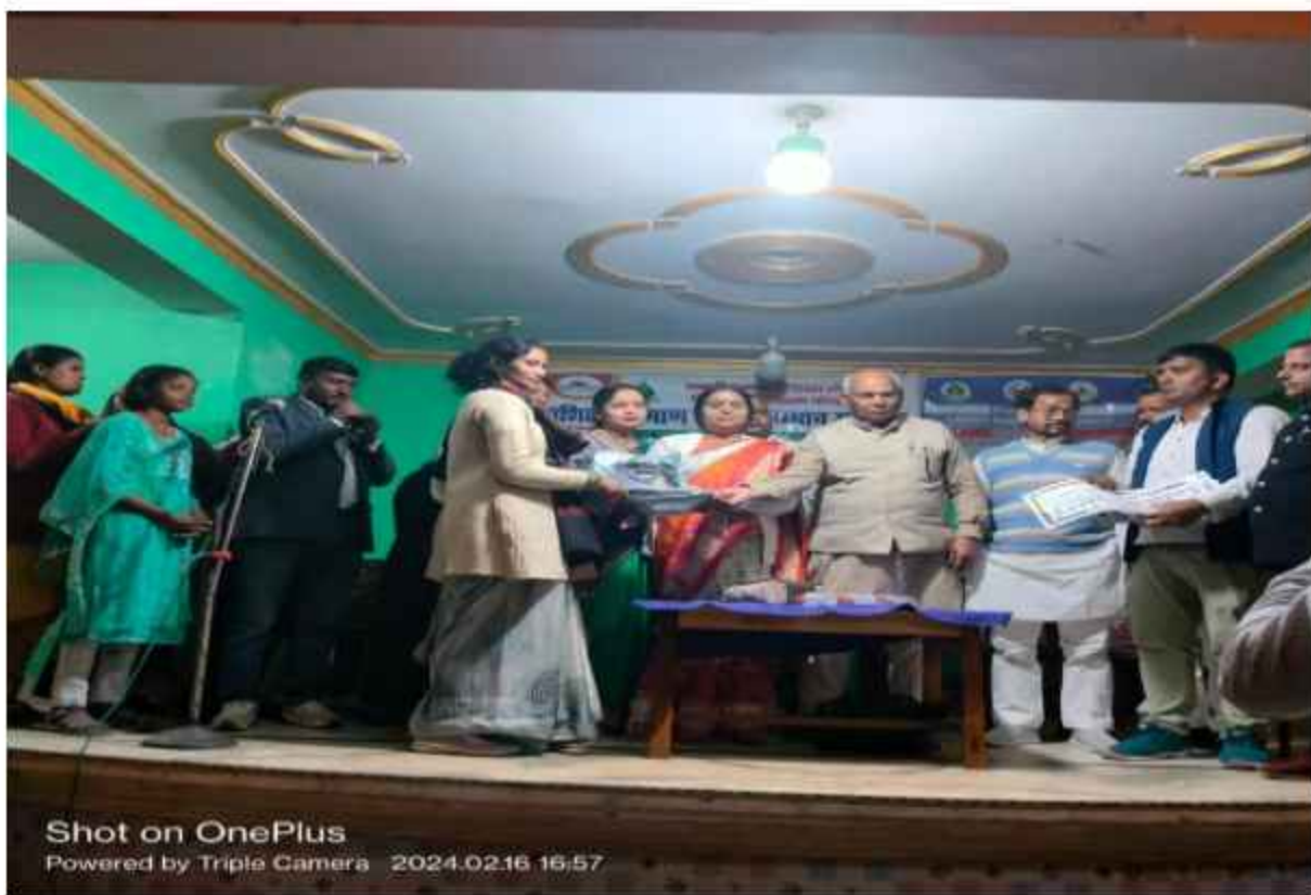
Shot on OnePlus Powered by Triple Camera 2024.02.16 16:57