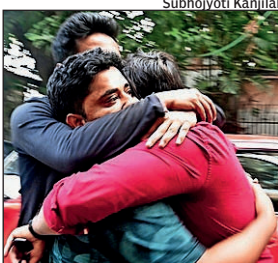
Primary teachers rejoice after the Calcutta high court verdict

The bench of justices Tapabrata Chakraborty and Reetobroto Mitra, acting on an appeal by the state govt against the single-judge bench's order, ruled on Wednesday, "The allegation of fraud and corruption pertaining to the entire recruitment process is not sustainable and the appointment of the 32,000 teachers cannot be