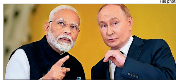
Prime Minister Narendra Modi with Russian President Vladimir Putin during his visit to Moscow in July 2024

Putin's main engagements are on Friday, starting with a visit to Raigadh in the morning that will be followed by a ceremonial welcome at Rashtrapati Bhawan. The le-